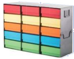
Side-access: 5 Layers and 3 Columns (ZKL304-532-FG)

We will recommend the perfect frozen layer rack matching scheme to improve freezer space utilization and satisfy storage requirements of biobanks.