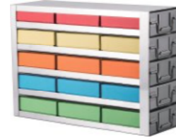
Drawer Type: 5 Layers and 3 Columns (ZKL304-532-CT)