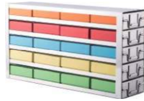
Drawer Type: 5 Layers and 4 Columns (ZKL304-542-CT)