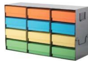
Side-access: 4 Layers and 3 Columns (ZKL304-432-FG)